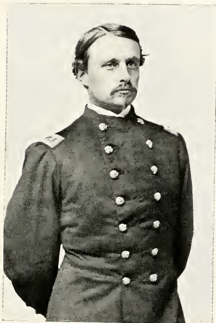
COL. ROBERT G. SHAW.